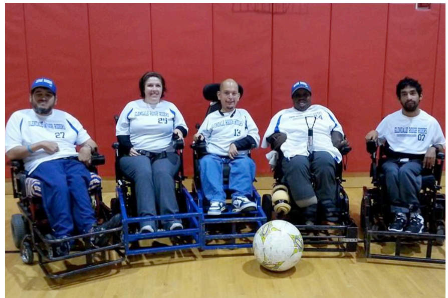
Glendale Rough Riders story on page 5

Pacific Power Soccer Wishes All the Teams